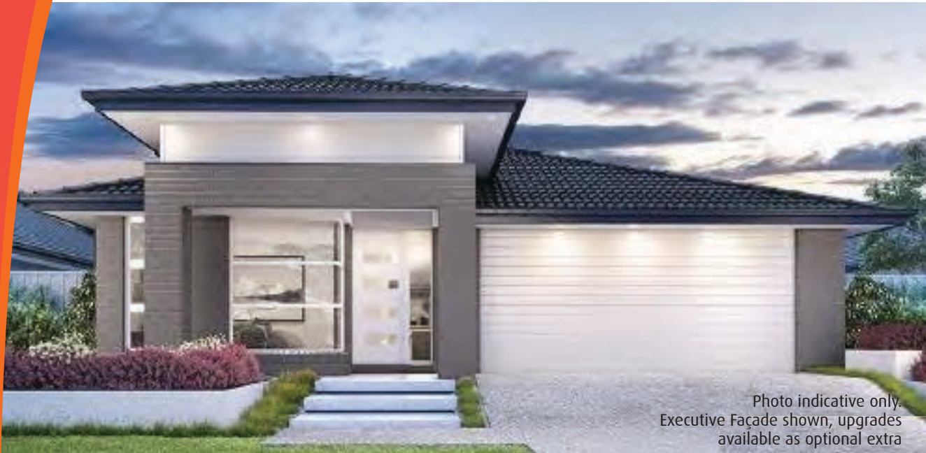
Photo indicative only. Executive Façade shown, upgrades available as optional extra

$490,232 | Size of Home 205.18m 2 Lot 704 Dairyman Drive, Raymond Terrace 630m 2